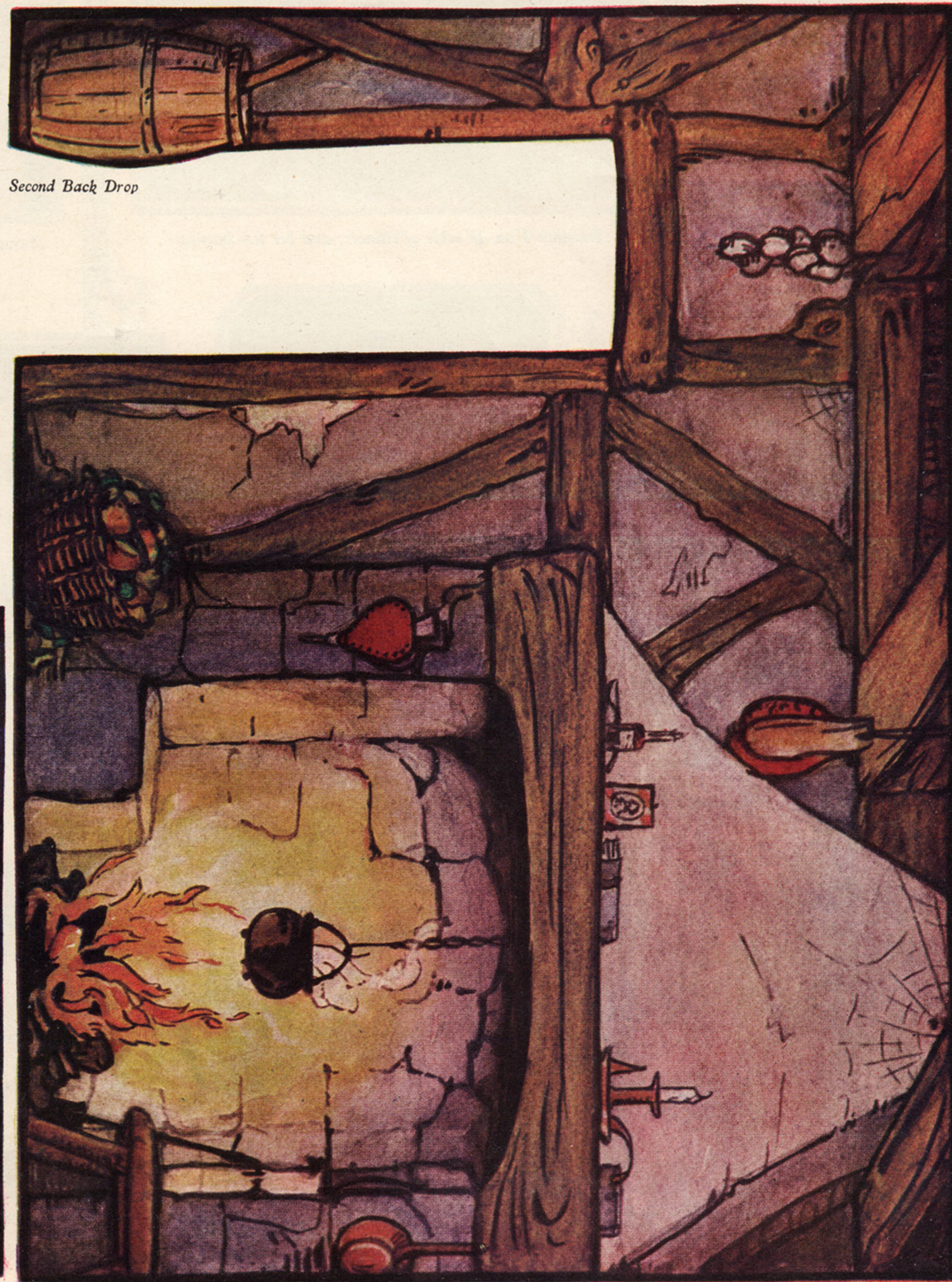
Second Back Drop